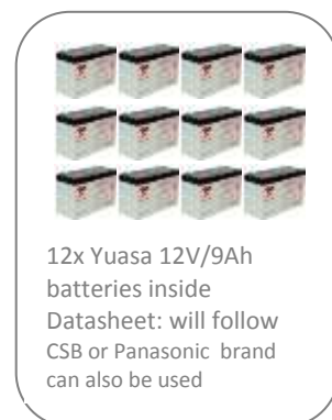
12x Yuasa 12V/9Ah batteries inside Datasheet: will follow CSB or Panasonic brand can also be used

Version: EN 24/09/2015 We reserve the right for technical changes and mistakes